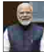
PM Mudra Yojana reflects an economic ethos where opportunities are accessible, initiatives are encouraged and every dream is given the support to grow, Modi said. "A glimpse of PM Mudra Yojana's transformative potential and how it has positively impacted our Yuva Shakti

NEW DELHI, Apr 8: Prime Minister Narendra Modi on Wednesday said the PM Mudra Yojana has strengthened the spirit of enterprise across India by removing barriers and trusting the aspirations of the people. On 11 years of the PM Mudra Yojana, Modi said the scheme has redefined access to credit by empowering millions with the confidence to dream and the means to fulfil it. "By removing barriers and trusting the aspirations of our people, it has strengthened the spirit of enterprise across India," the prime minister said on X.