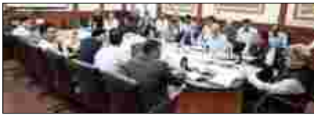
Targeted beneficiaries living in far off areas.

The free electricity initiative is expected to benefit over 2.22 lakh AAY households across the districts of the UT, ensuring near-universal district coverage. The process of identification and extension of this benefit to the eligible population is going on in coordination with the respective district administrations with many of the