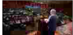
Jammu, Apr 8 : With over 600 heritage sites identified across Jammu and Kashmir, Chief Minister Omar Abdullah on Wednesday called for structured engagement with national and international agencies to unlock

their tourism potential. Abdullah was addressing a meeting on heritage promotion and cultural tourism to review measures for conservation and adaptive reuse of heritage assets aimed at