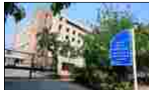
stipulated timeframe. The CAG report on Union Territory (UT) finances for the year ended March 31, 2024, said, "Accounts in respect of only four companies were audited up to 2022-23. In respect of 35 companies and corporations, audit of 139 accounts was in arrears for periods ranging from one to twelve years." According to the report, eight autonomous bod-

Jammu, April 8 : The Comptroller and Auditor General (CAG) has flagged a massive backlog in the finalisation of accounts of Public Sector Undertakings (PSUs) and autonomous bodies in Jammu and Kashmir, with large number of accounts remaining in arrears as on March 31, 2024. The CAG urged the UT government to ensure strict adherence to timelines for preparation and submission of accounts to strengthen financial discipline, transparency and governance. The audit panel warned that the persistent backlog undermines transparency and legislative oversight, and recommended that the government ensure companies, corporations and autonomous bodies submit their annual accounts within