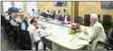
student welfare. He further directed the University for full implementation of e-office systems to modernize university administration and enhance operational efficiency. The Lieutenant Governor empha-

Jammu, Apr 8: Lieutenant Governor Manoj Sinha on Wednesday chaired the 2nd meeting of the University Council of the Cluster University of Srinagar at Lok Bhawan, Jammu. The University Council, which met under the chairmanship of the Lieutenant Governor, accorded in-principle approval to various agenda items and proposals including establishment of Abdul Ahad Azad Chair and adoption of postgraduate curriculum framework under NEP 2020 as per UCC guidelines. The Lieutenant Governor directed the Cluster University Srinagar to implement targeted reforms aimed at bolstering academic excellence and