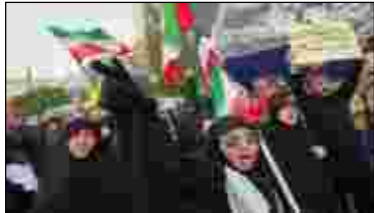
oil. But the details were not clear, nor was it known whether vessels would feel safe using the channel or whether ship traffic had resumed. It also was unclear whether any other country agreed to this condition.

- Iran said the deal would allow it to formalise its new practice of changing ships passing through the Strait of Hormuz, a crucial transit lane for